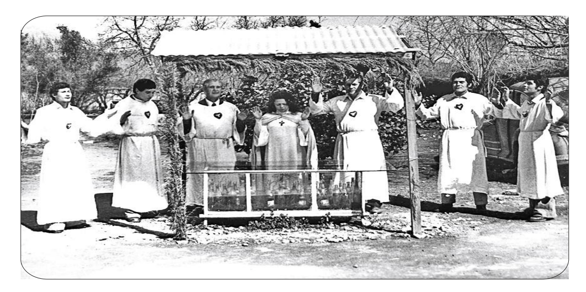
Brothers and Mother here praying around the Mesmer magnetic cuvette.