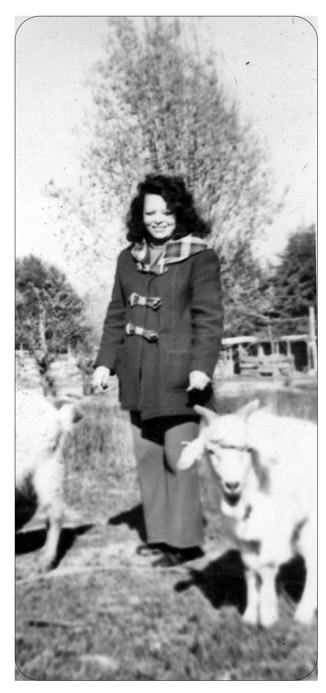
At the La Pintana site (1976)