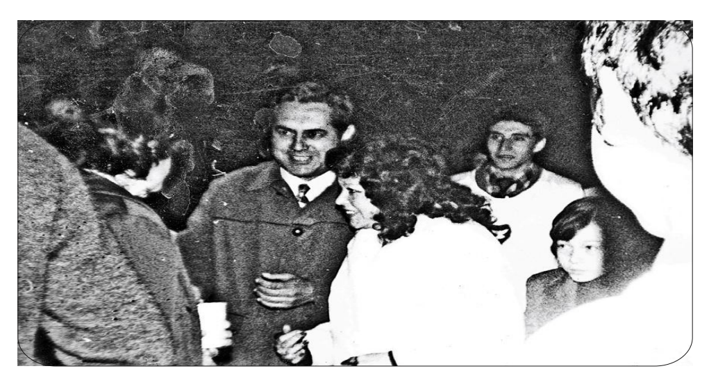
l Paz y Amor spiritual congregation anniversary (1976)